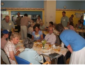
Summer Tea Party

There are many activities going on at WELL STREET UNITED CHURCH throughout the year for all ages to enjoy.