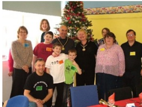
Christmas Day Lunch