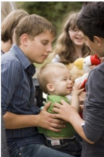
Hill End Camp