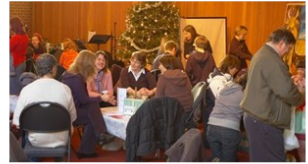
Breakfast at Bethlehem