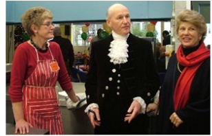
Special visit at Christmas Lunch