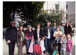
Church London Walk